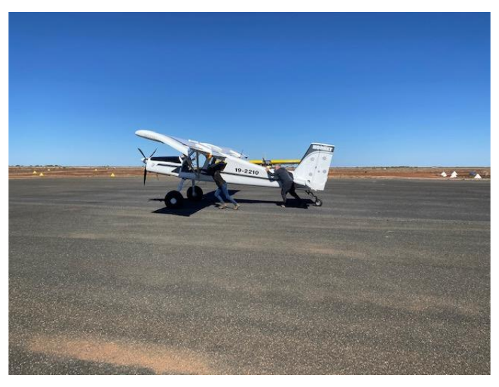
Friday 14<sup>th</sup> saw us depart for Nymagee . Again it was a bit rough flying & we saw the scenery change.

The trees changed to bushes the dirt changed to red & the sheep changed to goats.