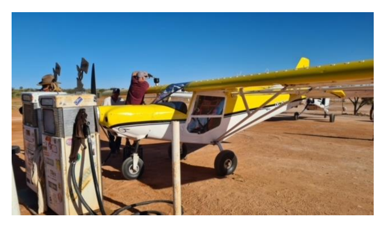
Tuesday 18<sup>th</sup>, Camerons Crn to Menindee via White Cliffs.

More turbulent air, so a stop for fuel & a feed at White Cliffs was on the cards. White Cliffs from the air looks like a giant ants nest with holes in the ground everywhere. Avgas was $3.50 a litre.